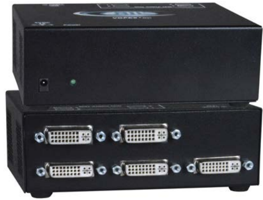
VOPEX-DVIS-4 (Front and Back)

The VOPEX® DVI Video Splitter enables up to four single link digital DVI displays to be driven by a single digital DVI source with no loss of signal.