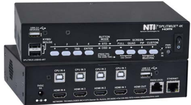
SPLITMUX-USB4K-4RT (Front & Back)