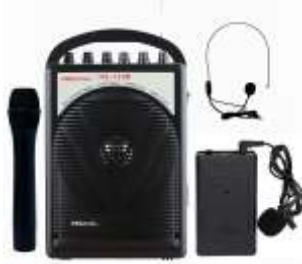
Portable P. A. System