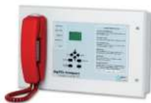
Fire Telephone System