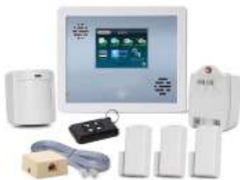
Wireless Assistant Calling System