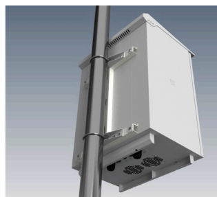
Outdoor & Weather Proof Racks