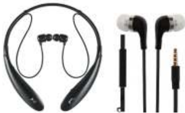
Headphones & Earphones