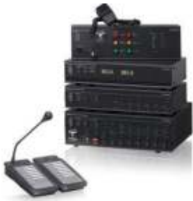
Digital P. A. System