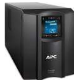
UPS & Digisets