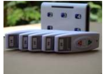
Wireless Security Alarm