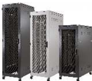
Server & Networking Racks