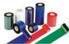
Wax Resin Ribbons