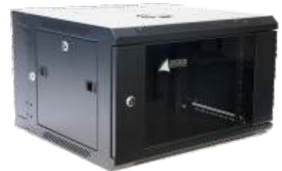
Wall Mount & Telecom Racks