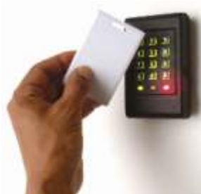
Door Access Card