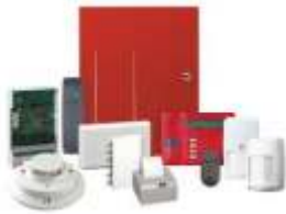
Fire Alarm System