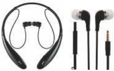
Headphones & Earphones