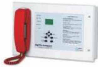
Fire Telephone System