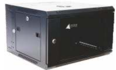
Wall Mount & Telecom Racks