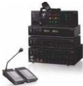
Digital P. A. System