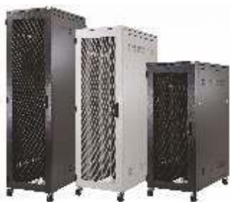
Server & Networking Racks