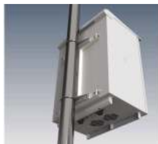
Outdoor & Weather Proof Racks