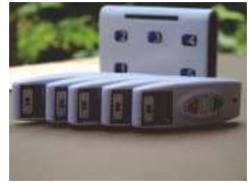
Wireless Security Alarm