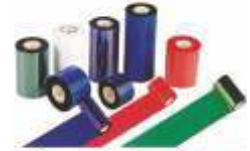
Wax Resin Ribbons