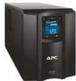
UPS & Digisets