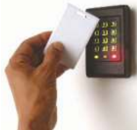
Door Access Card