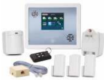
Wireless Assistant Calling System