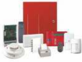
Fire Alarm System