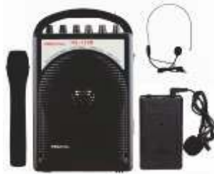
Portable P. A. System